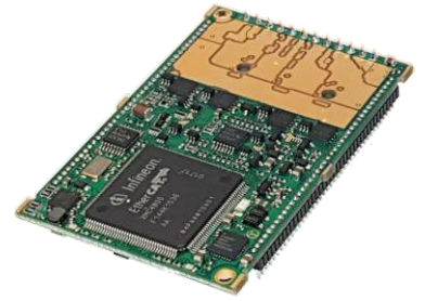
View with pins facing upwards.