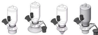
Indvejsning på tank