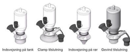
Indsvejsning på tank Clamp tilslutning Indsvejsning på rør Gvind tilslutning